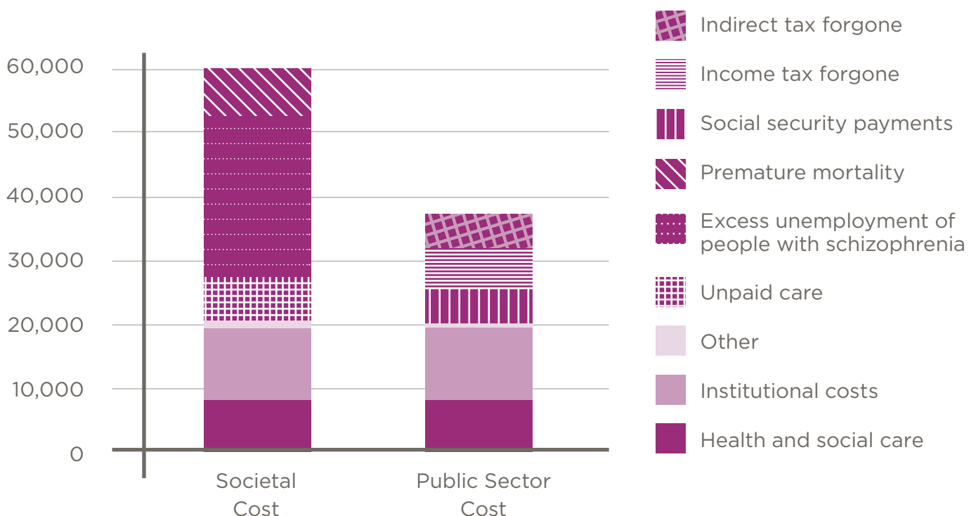
Figure 1: Annual costs of schizophrenia to society and the public sector (£ per person with schizophrenia, 2010/11 prices)

Around one third of societal costs are accounted for by direct expenditure on health and social care, provided both in institutions and in the community.